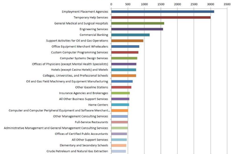
Industry Sectors That Are Hiring The Most