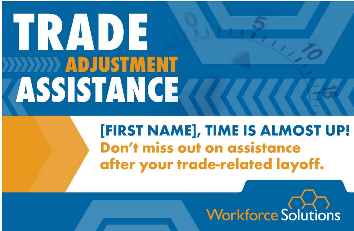
EXHIBIT IV: Customer Outreach Week 4